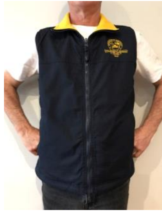
Club Vest $50