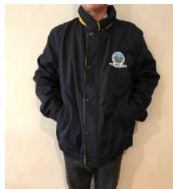
Winter Jacket $80