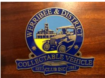
Metal Grille Badge $40