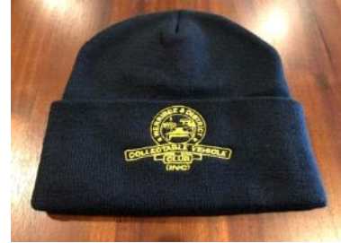
Club Beanie $15