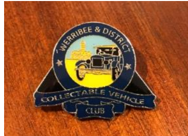
Small Hat Badge $5