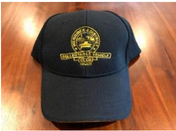
Club Cap $15