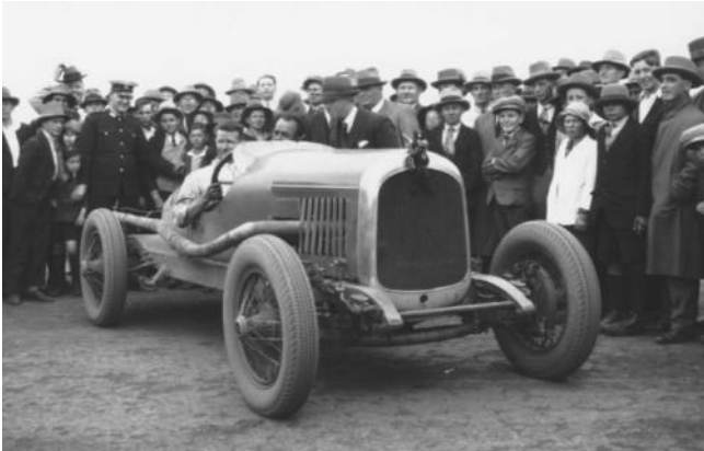
A race car at Lake Perkolilli clay pan racetrack in 1928.

"[Geoff's] response was: 'Drive it like you stole it, just enjoy it, enjoy the track and have fun,' that's all he cared about."