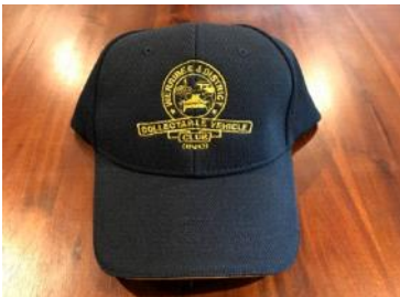
Club Cap $15