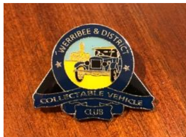
Small Hat Badge $5