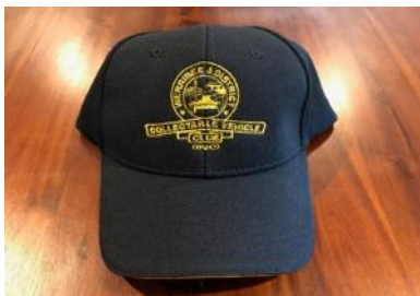
Club Cap $15