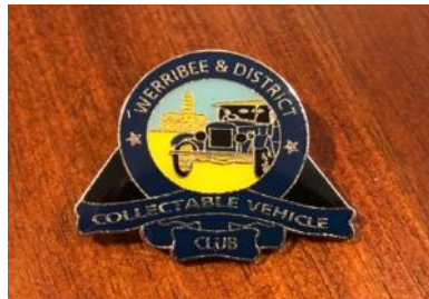
Small Hat Badge $5