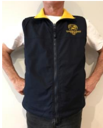
Club Vest $50