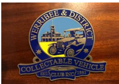
Metal Grille Badge $40