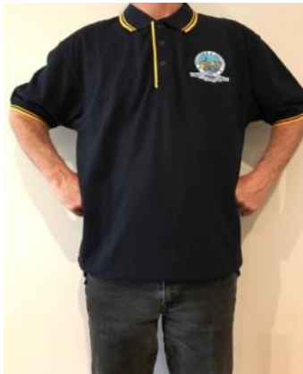
Club Polo $35