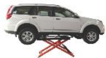
COMPACT SCISSOR LIFT EE-TS6600 2.7 TON/2700 KG CAPACITY