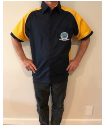
Summer Shirt $50