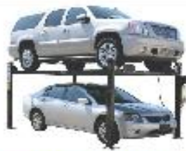
4 POST PARKING HOIST TL3.6PH-S 3.6 TON/3600 KG CAPACITY