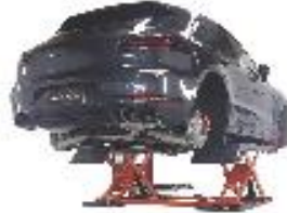
MID RISE SCISSOR LIFT EE-MR35 3.5 TON/3500 KG CAPACITY