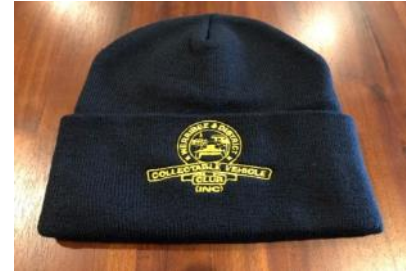
Club Beanie $15