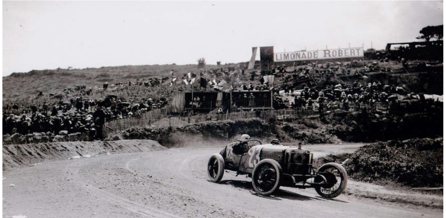
The Type-S racing in the 750-kilometre French Grand Prix in 1914 in Lyon.