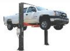
2 POST CLEAR FLOOR TL4.00HDI 4 TON/4000 KG CAPACITY