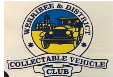
Vehicle Window Decal $1