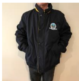
Winter Jacket $80