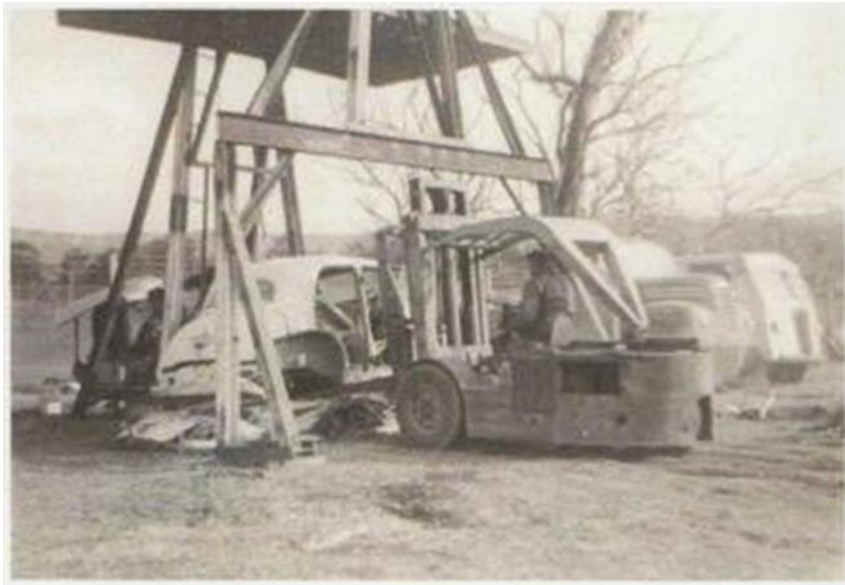
Feeding car bodies into the Crusher at Yallah.

Before long most of the spaces were occupied and a holding area had to be created for vehicles awaiting processing. An area was needed for the remains of vehicles which had been moved out to allow another to be placed in that position. These expended bodies were stacked in a big heap awaiting a suitable time for a fire to consume all the combustible substances leaving a steel shell free of non-ferrous materials. This operation always coincided with a wet day when the thick black smoke was washed away by the rain and caused no objection from authorities.