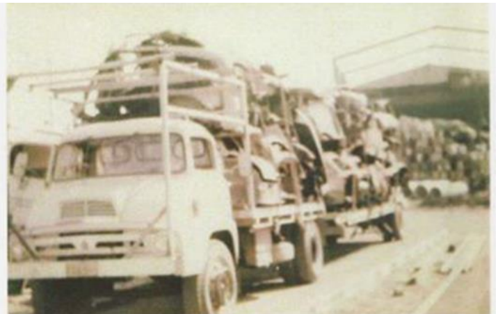
Ford Thames and dog trailer ready for a trip to Sims Metal at Mascot.