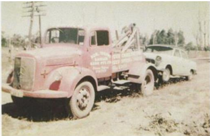
Mercedes Tow Truck with the next offering for the Used Spares Division.

The ungainly load of scrap steel was secured with chains and load binders which needed to be tightened regularly as the load settled. Also, the driver needed to be on the lookout for pieces of metal which tended to slide out periodically.